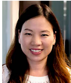
CHELSEA SUN Pasadena, CA