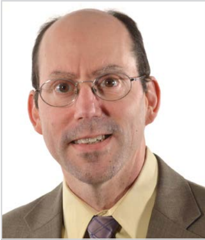
LEWIS HAMILTON Chicago, IL