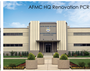
AFMC HQ Renovation PCR