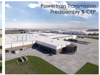
Powertrain Transmission Preassembly & CEP